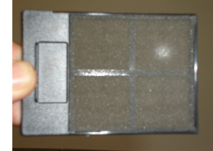
Filter should be free of all dust particles for air flow