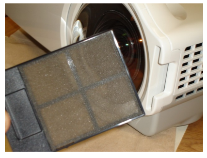
Examine filter for dust particles or dirt blockage