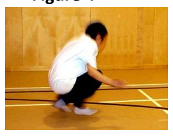
Land on both feet in squat position